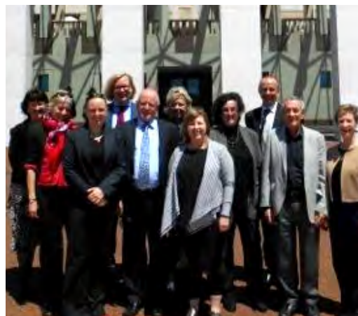
The National Advocates for Arts Education at Parliament House talking about the Australian Curriculum: The Arts with members of parliament and departmental officials.

Ausdance helped spread the word on the issue of proper pay for dancers, talking with ABC and Fairfax media. In partnership with MEAA we are reviewing information provided to dancers and employers via our website on agreement and award conditions.